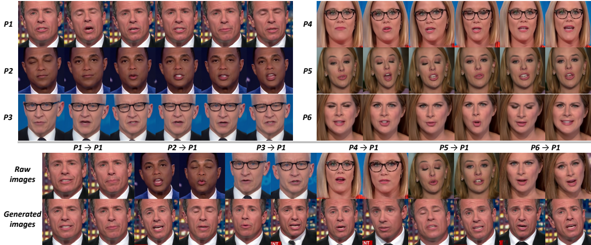
Fig. 2. Face reenactment results of our proposed method. The top half is generated from individual audio input with pose and blink signals, while the bottom half is generated from the information of other persons. P1 to P6 represents different identities.