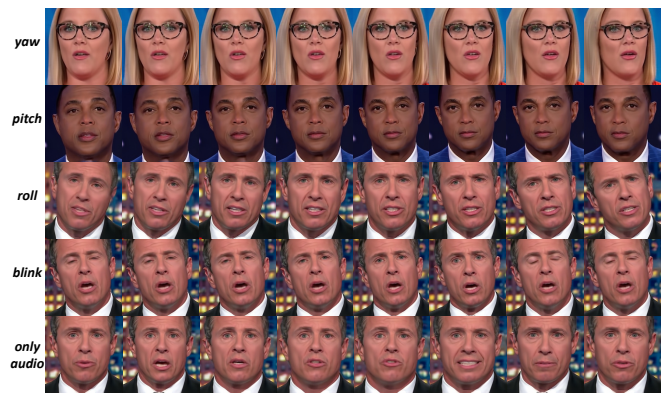
Fig. 4. Decoupling experiments of the pose and the blink information. Images of the first four rows are under only one control variable, while the last row contains all variables.

A novel APB2Face structure is proposed in this paper, which can use multi-information as control signals to reenact pho-