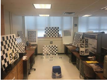
Fig. 2: Proof-of-concept indoor experiment setup for the proposed aided INS with point and plane features. ArUco makers [31] are placed in the workspace to serve as planar point features and thus to create point-on-plane constraints.